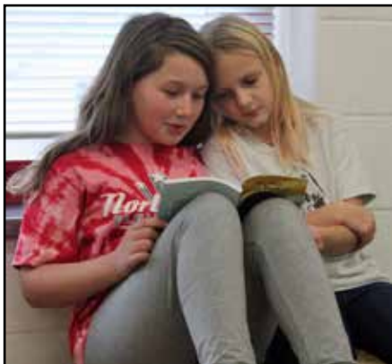
Northside fifth-graders dig into a new book about Rosa Parks, purchased through Give-a-Gift in 2018.

Help build classroom libraries during event Friday, Nov. 8 at Main Public Library