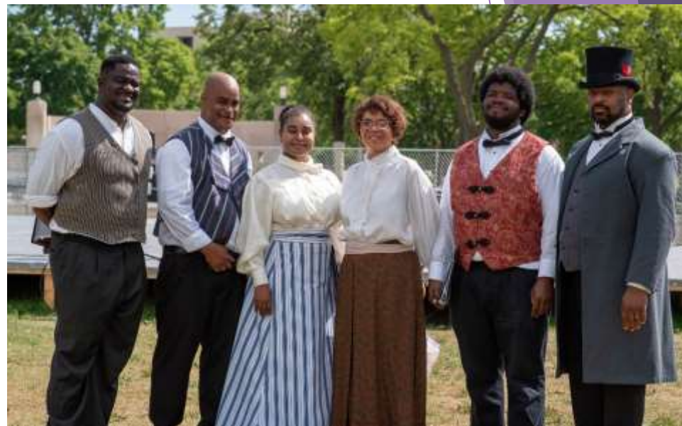
Enduring Families performers at People Fest 2019