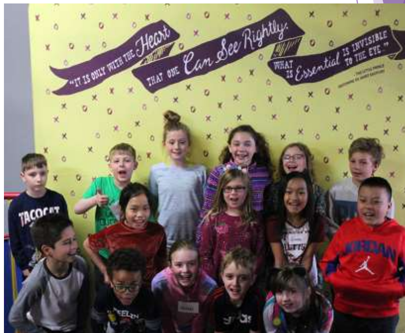
Students at XOXO exhibit