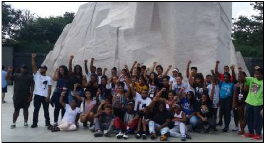
Participants in the Legacy Keepers trip visited the Martin Luther King Jr. Memorial in Washington, D.C.