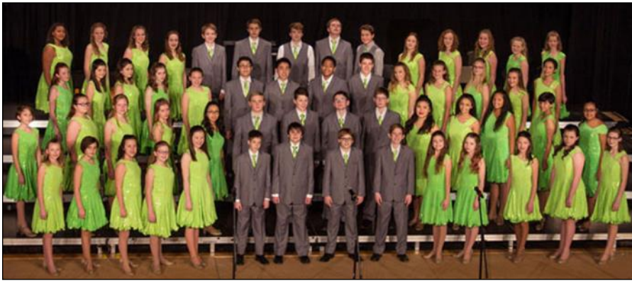
The 9th Street Connection, a show choir featuring 65 students from Lincoln Middle School/SOTA II/Coulee Montessori, competed March 11 in Wheaton, Ill.