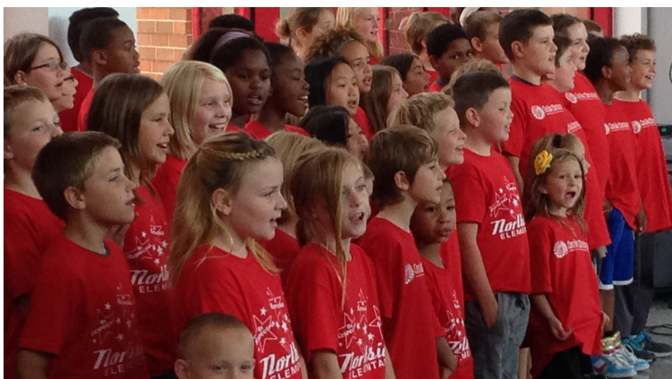
Northside students perform the new school song at the Sept. 18 Open House for the new school. The song was written with funding from an LPEF memorial fund. Details inside.