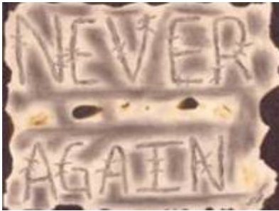
Student artwork from Logan Middle School