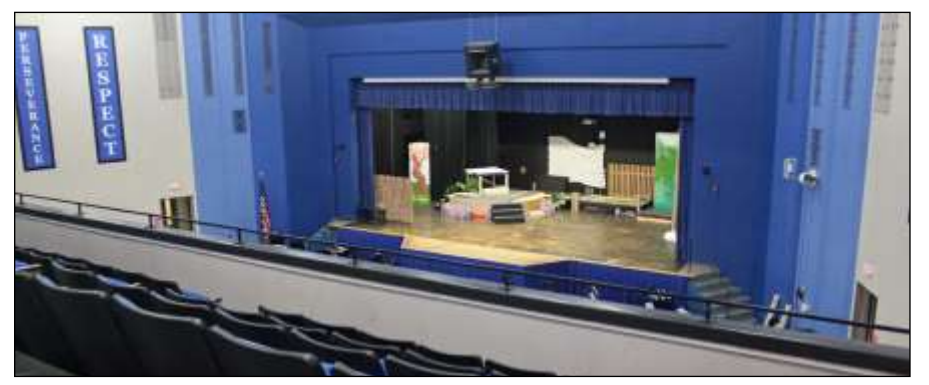
The Logan Middle School Auditorium is one of the best performance spaces on the North Side, and is the main venue for bands and choirs from both Logan High and Logan Middle.