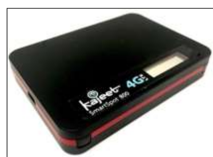
Wireless internet access will be offered to students through devices like this.

The District provides equal opportunity for students with its 1:1 technology initiative – laptops for high school students and iPads for students in grades 5-8. But about 30% of students do not have wireless internet access at home. To provide equity, the District is planning to offer wireless hotspots for